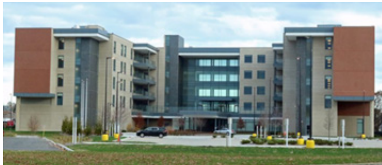
Illinois Veterans Home - Chicago

The homes' comprehensive model of care considers the medical, personal, and emotional needs of each resident. The staffs are uniquely capable of serving the needs of the veteran community and offering an environment that honors their service to the country.