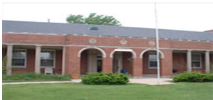
Illinois Veterans Home - Manteno

One of the features offered at each home is outdoor areas for residents to enjoy. Staff members frequently assist residents in spending time outdoors whenever weather permits, to get some sunshine and fresh air. Enhancements to outdoor living areas would be highly appreciated by the homes, giving residents more amenities to enjoy during good weather. Examples include, but are not limited to—park benches, awnings, garden fixtures and so on.