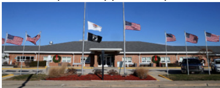
Illinois Veterans Home - LaSalle

Residents are encouraged to have visitors and each home develops programs that facilitate family and community events. The homes' activities professionals develop meaningful and creative programs to engage resident veterans in their community and insert joy into their day.