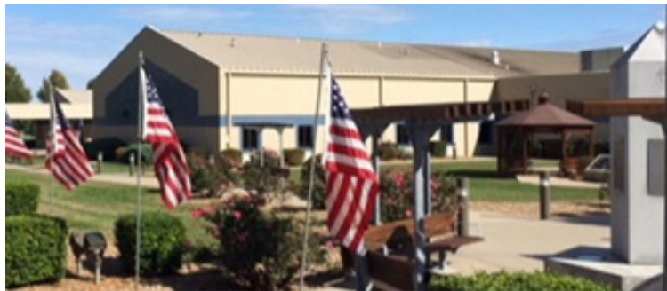
Illinois Veterans Home - Anna

The Commanders Special Project this year involves the Illinois Veterans Homes. Illinois veterans (and eligible spouses) seeking skilled and domiciliary care are offered five unique veterans' homes located across Illinois: Anna, Chicago, LaSalle, Manteno, and Quincy.